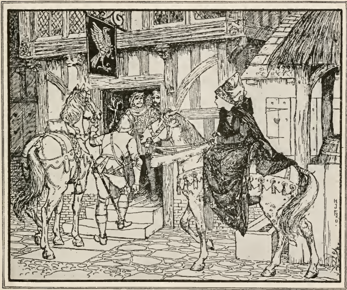
"Elizabeth goes to the inn to meet the conspirators"